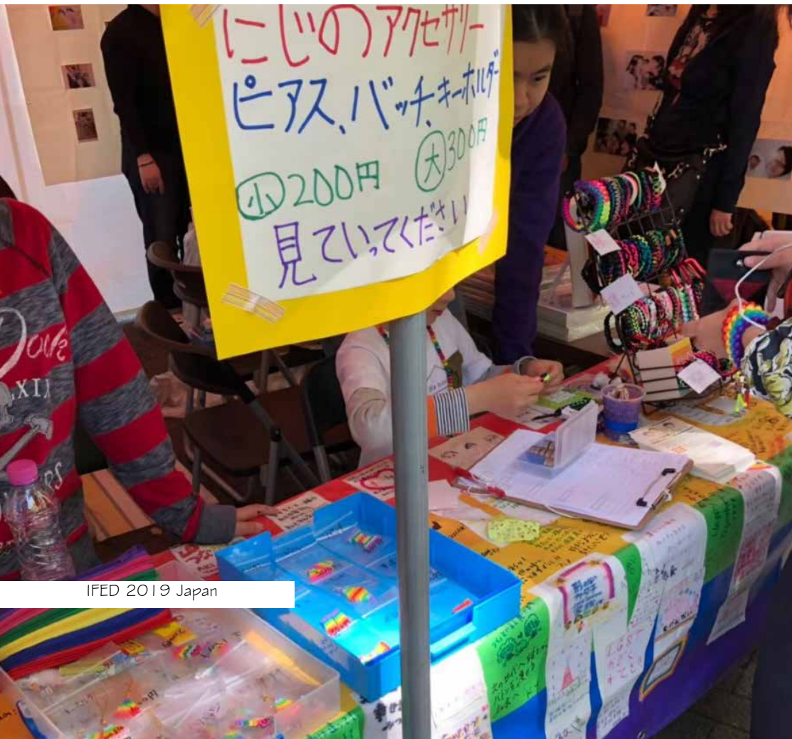
IFED 2019 Japan

In a successful event hosted by the City of Geneva, the new NGO “International Family Equality Day” was officially launched at the beginning of May, 2018.