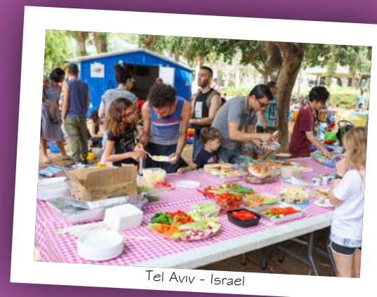
Tel Aviv - Israel

For the first time – we hosted a fabulous Drag Queen artist who read and performed a famous Israeli children story. We all had great time! Thank you for supporting this great project!