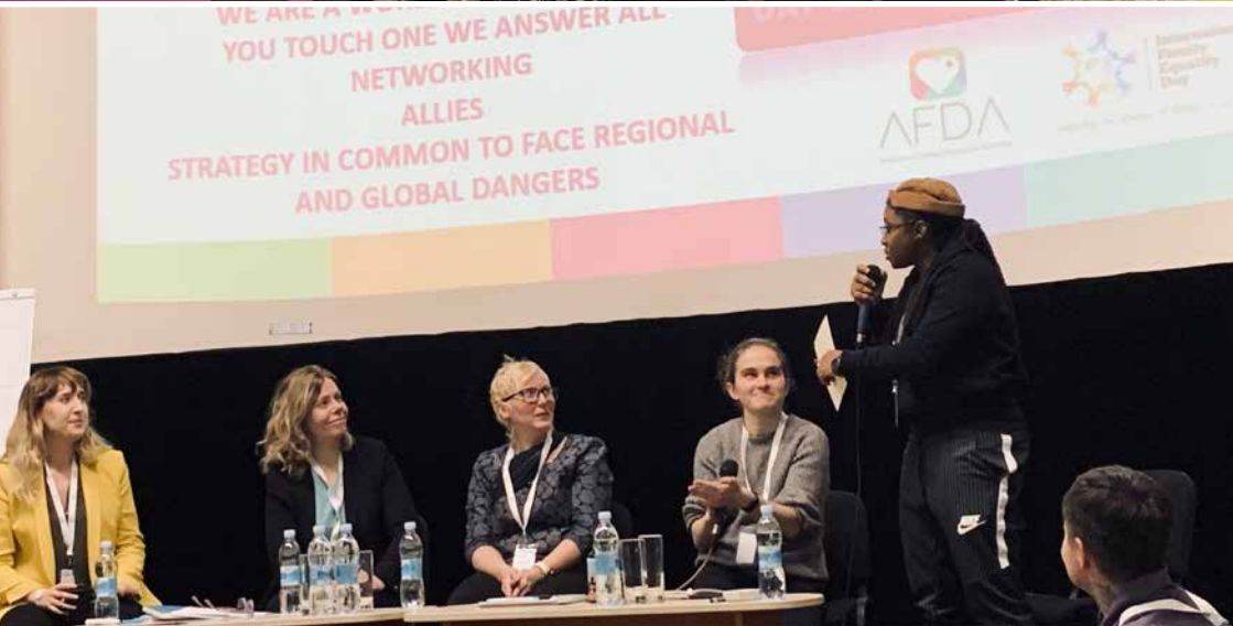
Images left: at the Ilga World IFED Workshop, at the Stonewall Human Rights Conference in NYC, at the panel discussion «From Ukraine to the world, exploring the contexts of rights in which we freely build and live our sexualities, families and parenthoods» during the European Lesbian* Conference in Kyiv.