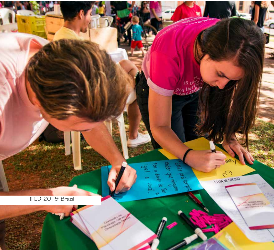
IFED 2019 Brazil

For this reason the IFED motto for 2020 focuses on Family Diversity in Education, to contribute with added visibility and new alliances to ending discrimination in the education systems.