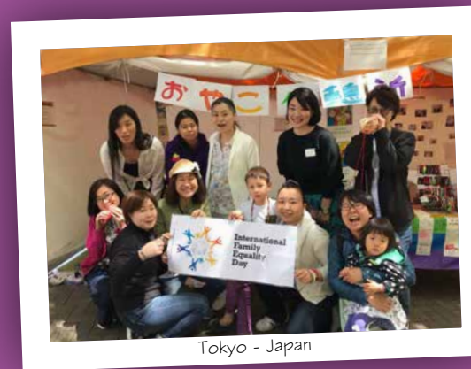
Tokyo - Japan

It is meaningful to show our family presence to LGBT people to encourage them, and to provide a sense of hope that they, themselves can also start their own families. Also, we have a gay couple that has their own child through surrogacy so this is gaining more interest amongst the gay community.