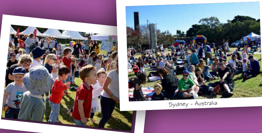
Sydney - Australia