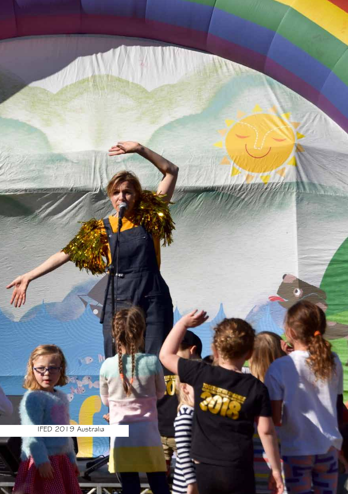
IFED 2019 Australia