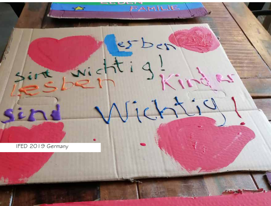
IFED 2019 Germany

The predictors of mental health in this sample of adult offspring with Lesbian parents were also examined (Koh, Bos, & Gartrell, 2019). Cross-sectional analyses were used to determine whether mental health was associated with personal and family characteristics, the quality of their important relationships and features unique to the offspring of same-sex parents, such as homophobic stigmatization. In general, the predictors of mental health for the adult offspring of lesbian mothers were similar to those found in the general population. Specifically, level of education, having an intimate relationship and the quality of relationships with intimate partner, friends and parents predicted the mental health of emerging adults with lesbian parents. However, adults who reported homophobic stigmatization due to their parents' sexuality reported higher levels of behavioural and emotional problems than those who did not. The authors highlight that future research is needed to understand whether societal changes in the acceptance of same-sex parents have positive consequences for the wellbeing of children raised by same-sex parents.