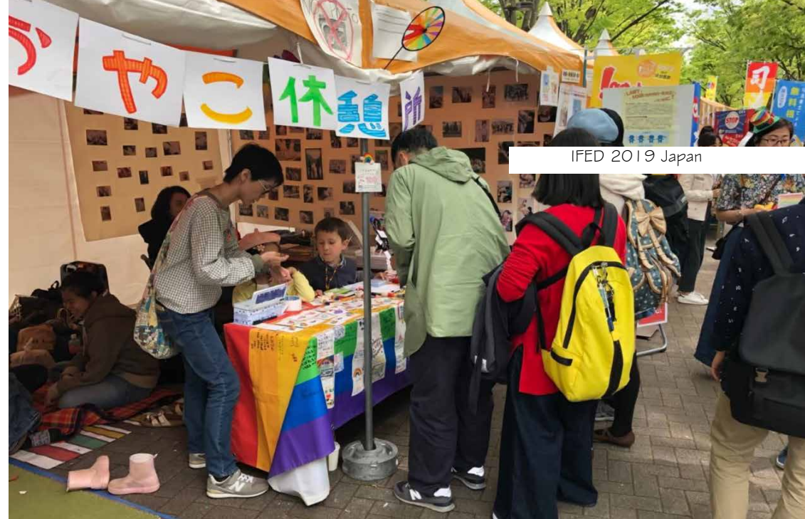
IFED 2019 Japan