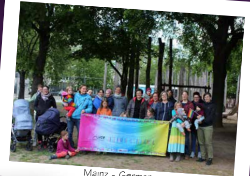
Mainz - Germany

This year the ILSE Mainz-Wiesbaden group (ILSE = Initiative lesbischer und schwuler Eltern) took part in the IFED for the first time. We had a picnic in the Goethe Park in Mainz and celebrated the IFED and the 10th anniversary of our group. 15 adults and 13 children aged 0 to 10 came together. We enjoyed eating and talking to each other. The older children were playing at the playground and on the lawn.