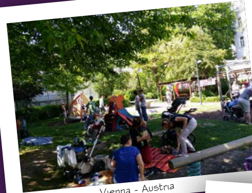
Vienna - Austria