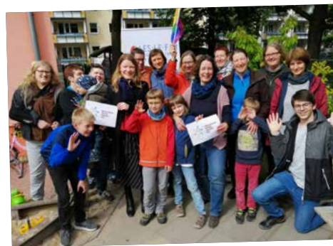
Berlin - Germany